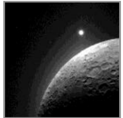
E _____ _____