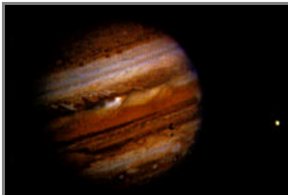
G _____ _____