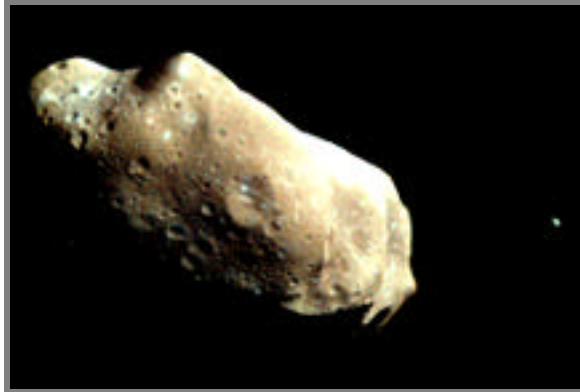
B _____ _____