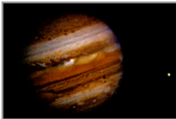
G _____ _____