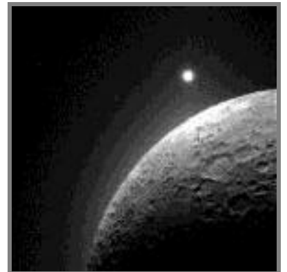
E _____ _____