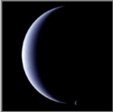
A _____ _____