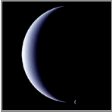
A _____ _____

These photos all contain more than one object - either a planet, moon, or asteroid. Find each image in Solar System Update and identify the heavenly bodies in each close encounter.