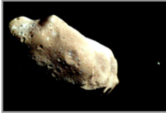
B _____ _____