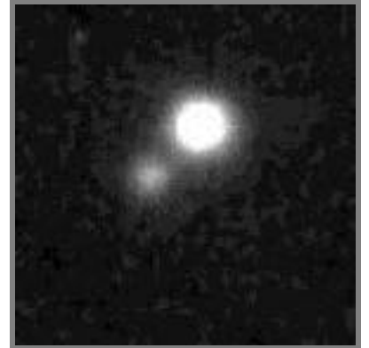
C _____ _____