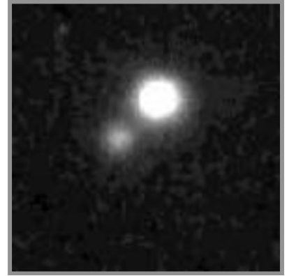
C _____ _____