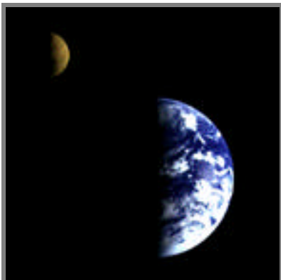
F _____ _____