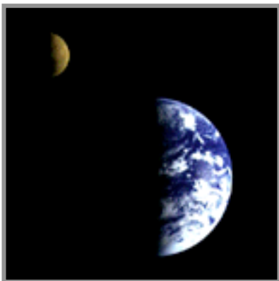
F _____ _____